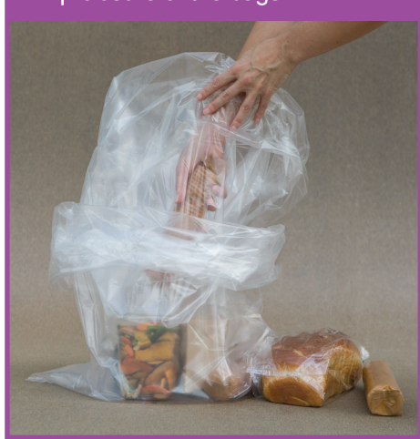
3. Twist the top of the inner bag.